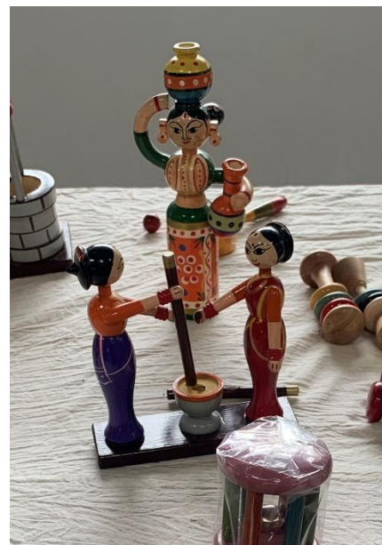
Toys in Display Area