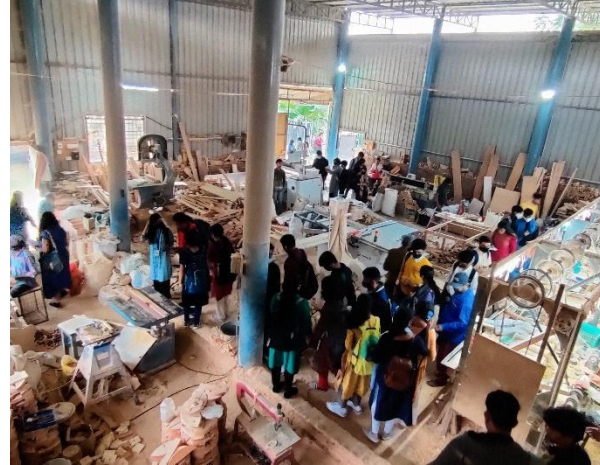
View of Manufacturing Unit I from storage space