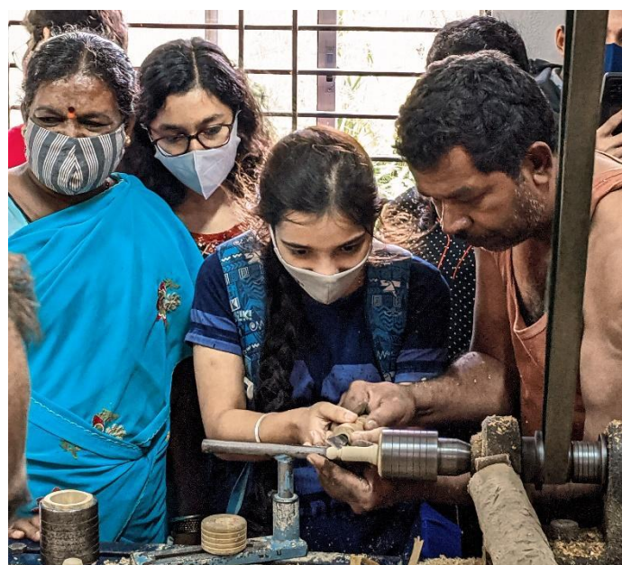
Student's hands on experience at training center