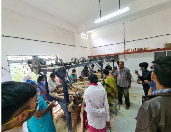
At the training center