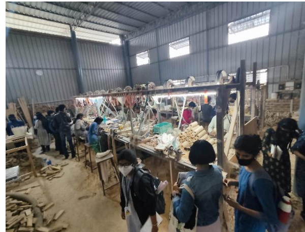
At the Manufacturing Unit I