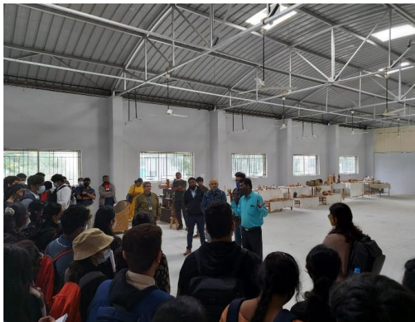
Discussions at Display Area