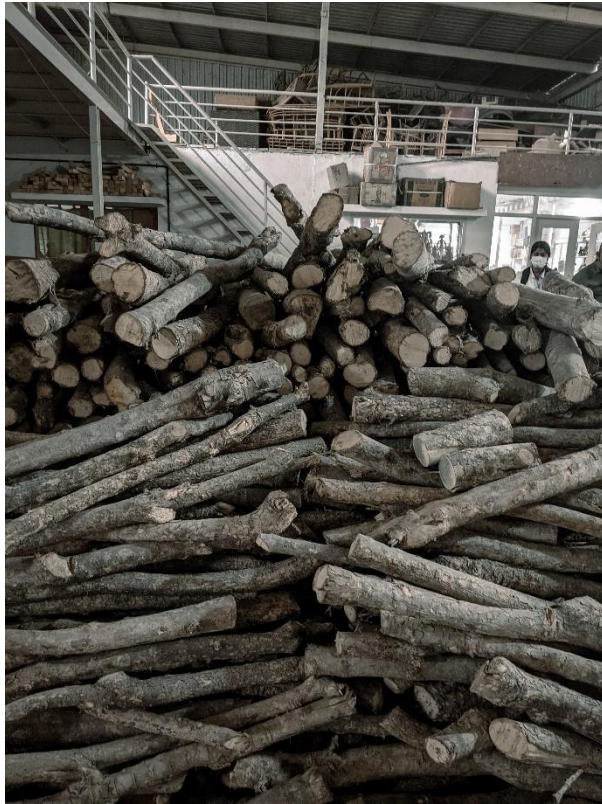
Seasoning of wood